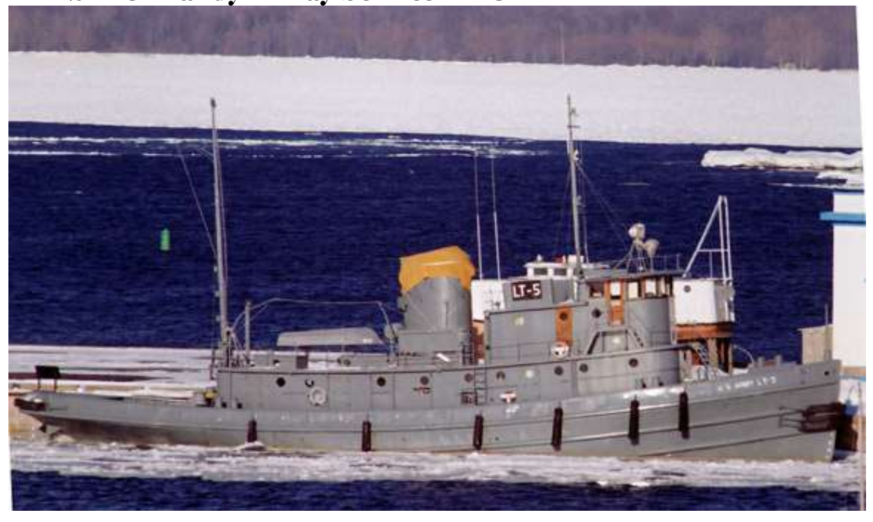
WW2 Normandy D-Day Service LT-5

Blog entries indicate this boat is lacking funds for restoration and may be scrapped – possible D-Day service, but not at all certain!