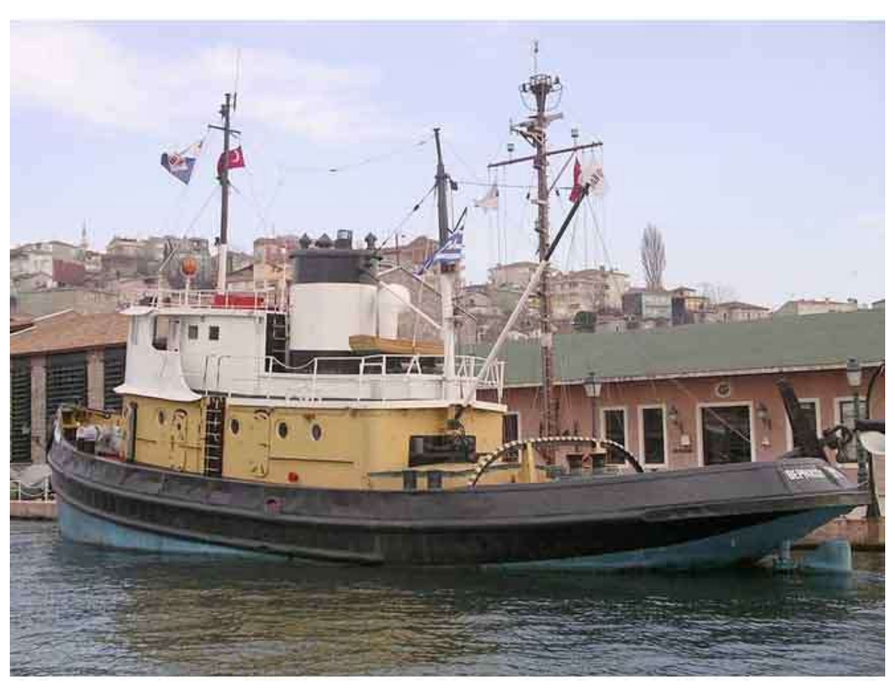
2004: for preservation to the "Rahmi M. Koç Museum" at Istanbul (TUR) as VERNICOS