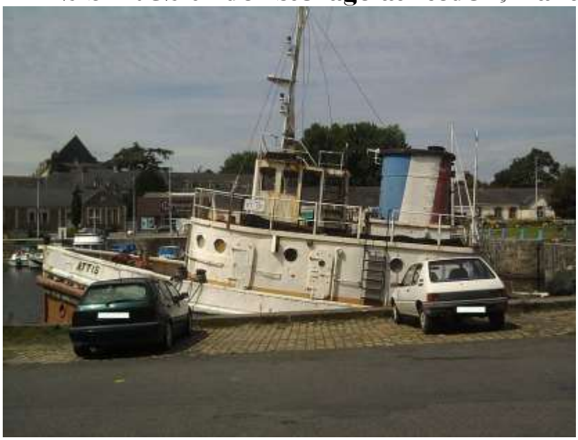
WW2 ST 732 under storage at Redon, Nantes, France

Blog entries indicate this boat is lacking funds for restoration and may be scrapped – possible D-Day service, but not at all certain!